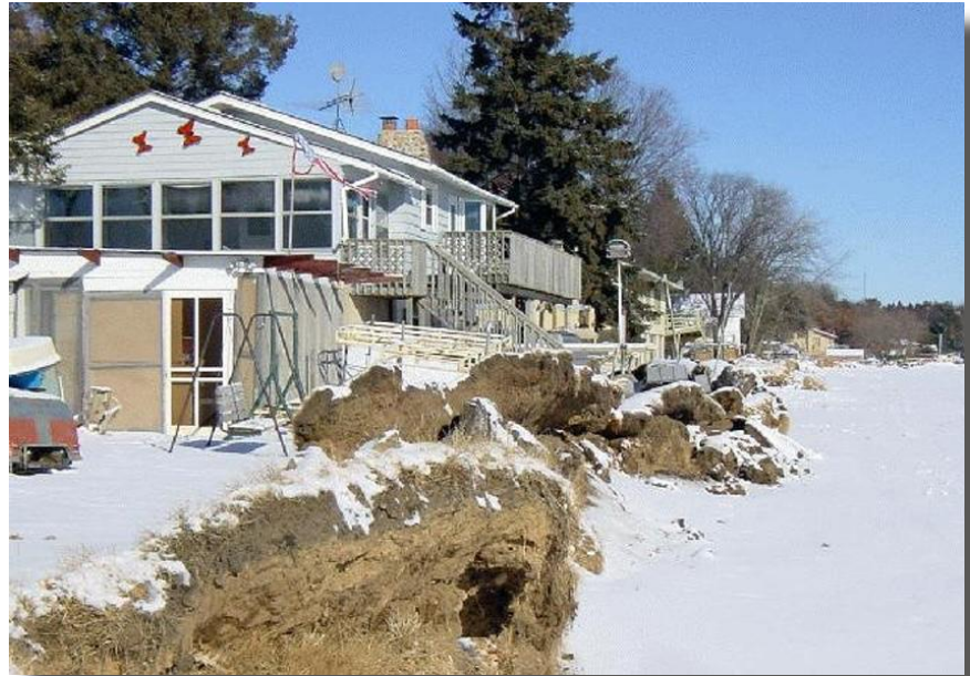
Ice ridge formed along the shore of Shamineau Lake in Morrison County.

Property owners occasionally return to their cabins in the spring only to discover they are dealing with property damage caused by a phenomenon called "ice heaving" or "ice jacking". This powerful natural force forms a feature along the shoreline known as an "ice ridge". The result may include significant damage to retaining walls, docks and boat lifts, and sometimes even to the cabin itself.